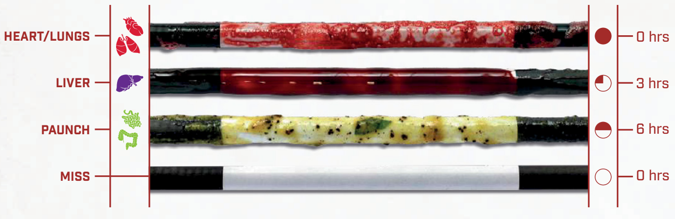
*U.S. Patent 9,121,678 *U.S. Patent 9,366,513

Proof is Power. And Bloodsport's Blood Ring™ is proof you can see in an instant. The patented technology identifies which organ has been hit based on the blood type and color on the ring. These clues serve as a map to direct your pursuit for improved odds at a successful recovery.