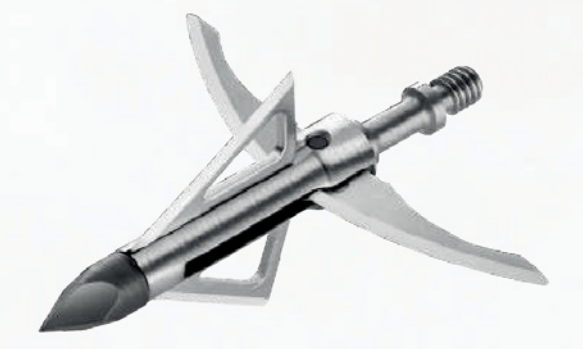
3-PACK [CHISEL TIP]