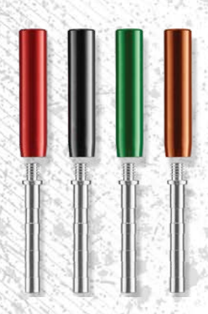
R.O.C. OUTSERTS 6-PACK (60 GR)

The R.D.C. (Reliable Outsert Component) System was designed to strengthen micro-diameter and small diameter arrows for better penetration and performance upon impact. Extensive testing found these arrows excel in flight, but poorly engineered outserts add stress to arrow walls and tips, ultimately causing failures. The R.O.C. System addresses these issues with a patented shock-absorbing and energy-transferring design that maintains accuracy and maximizes impact.