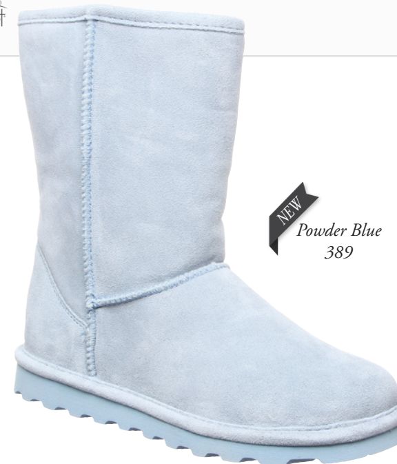
NEW Powder Blue 389