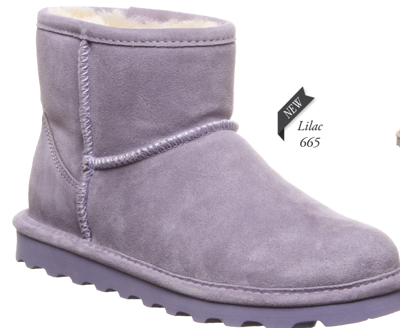
NEW Lilac 665