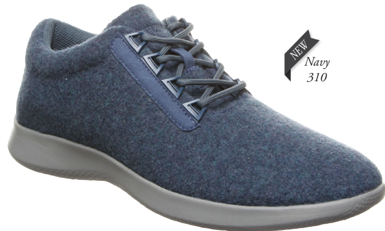
NEW Navy 310

STYLE NO. 2241M SIZES 8-13 half-sizes available