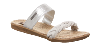
Linen/Silver Metallic 379