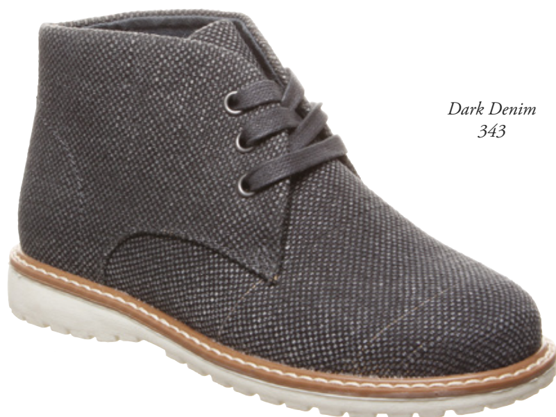
Dark Denim 343