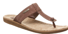
Dk. Brown 209