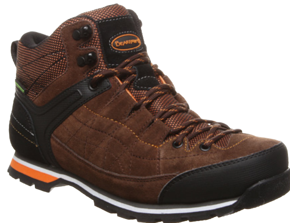
Dark Brown 209