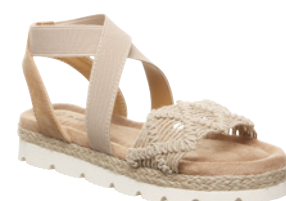
Natural/Tan PU 120