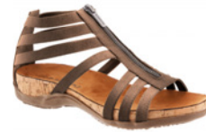
Rose Gold 092