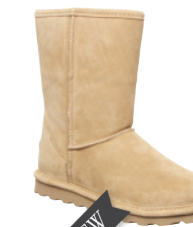
NEW Sand 274