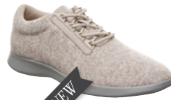
NEW Taupe 122