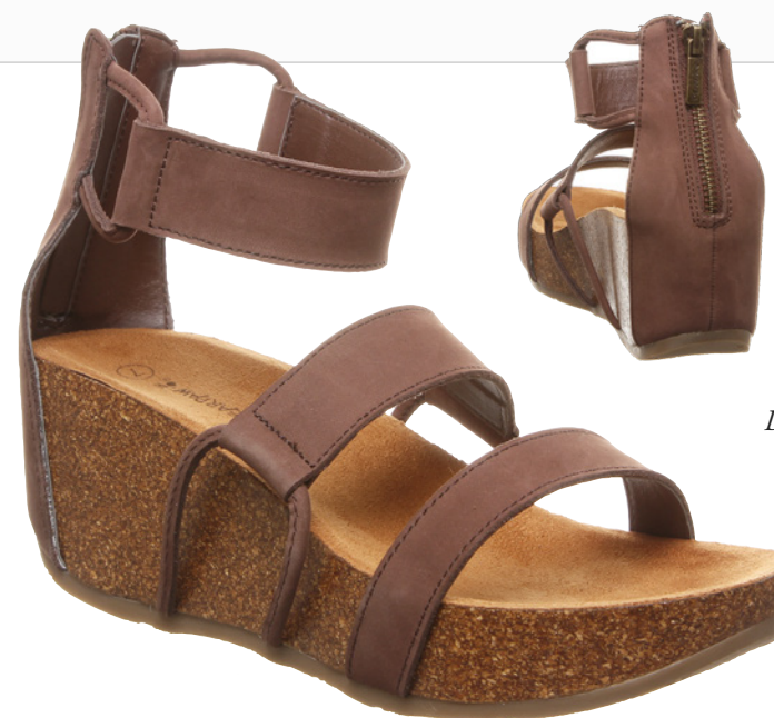
Dk Brown 209

STYLE NO. 2218W SIZES 5-11 half-sizes available