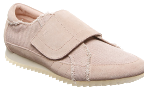
Blush / Hvy Canvas 647

STYLE NO. 2229W SIZES 5-11 half-sizes available