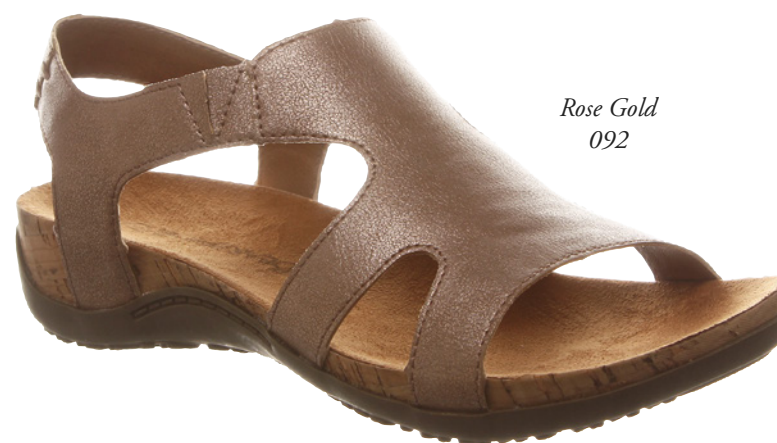
Rose Gold 092