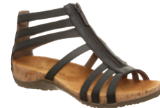
Solid Black 011