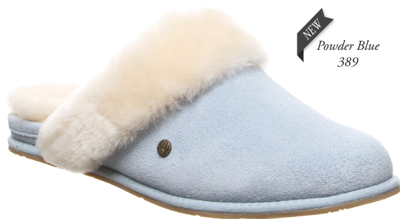
NEW Powder Blue 389