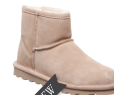
NEW Blush 647