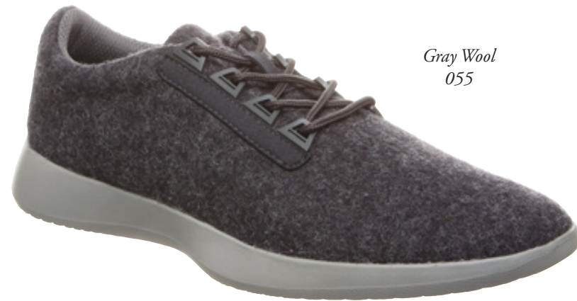
Gray Wool 055

STYLE NO. 2178M SIZES 8-13 half-sizes available