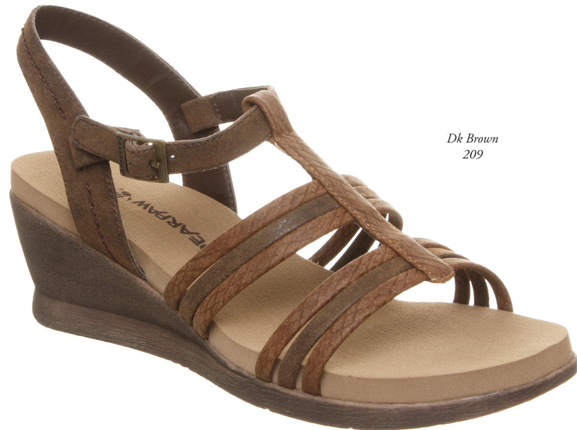
Dk Brown 209

STYLE NO. 2095W SIZES 5-11 half-sizes available