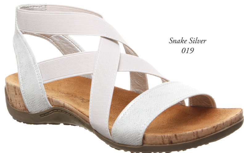
Snake Silver 019