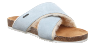
Powder Blue 389