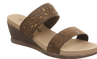
Dk Brown 209