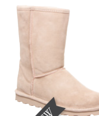
NEW Blush 647