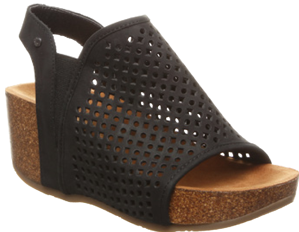
Black Leather 011

STYLE NO. 2217W SIZES 5-11 half-sizes available