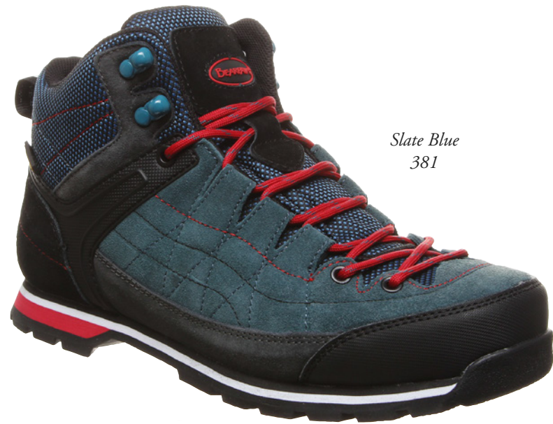
Slate Blue 381

STYLE NO. 2192M SIZES 8-14 half-sizes available