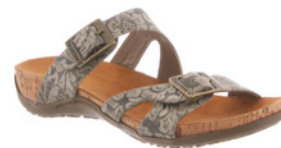
Mushroom Embossed 500