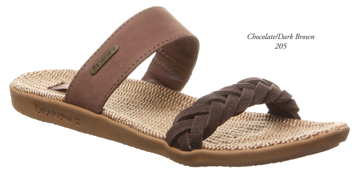
Chocolate/Dark Brown 205