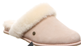
NEW Blush 647