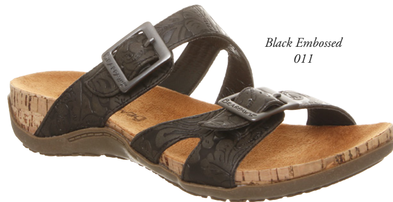
Black Embossed 011