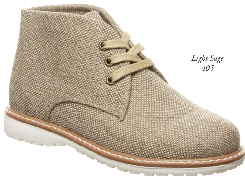
Light Sage 405