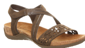
Dk Brown 209