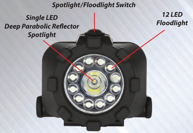
NSP-4604B and NSP-4606B