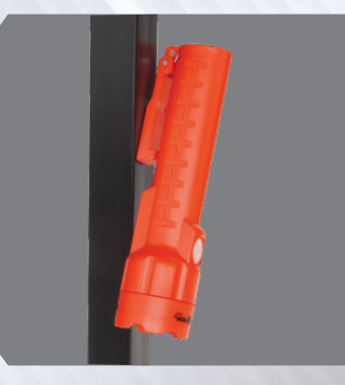
Hands-free magnet in clip

Built in pocket/belt clip with integrated magnet