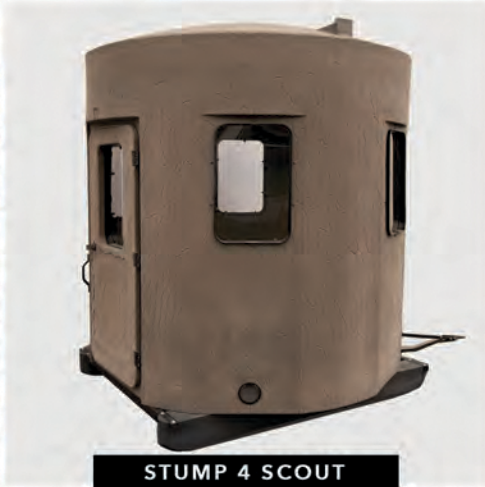
STUMP 4 SCOUT