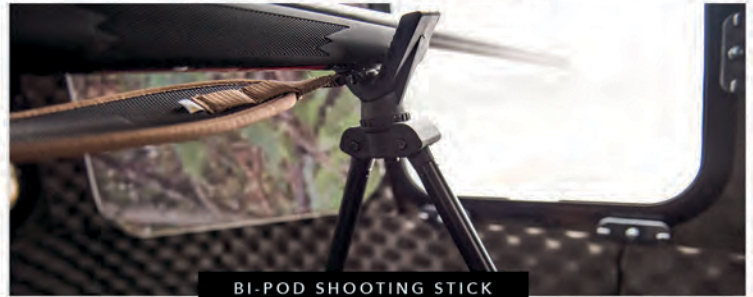
BI-POD SHOOTING STICK