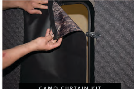
CAMO CURTAIN KIT