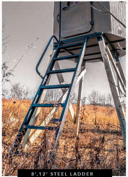
8'12' STEEL LADDER