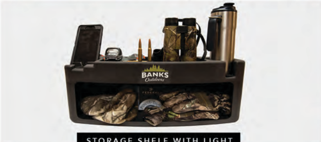
STORAGE SHELF WITH LIGHT