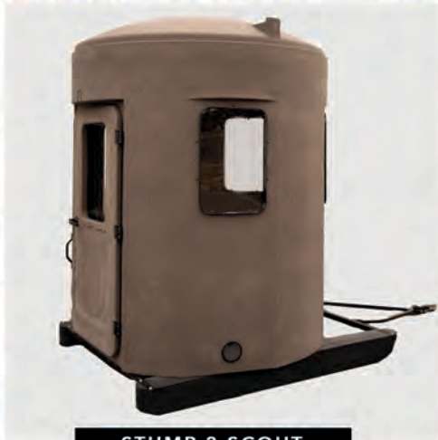
STUMP 3 SCOUT