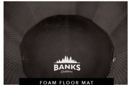
FOAM FLOOR MAT