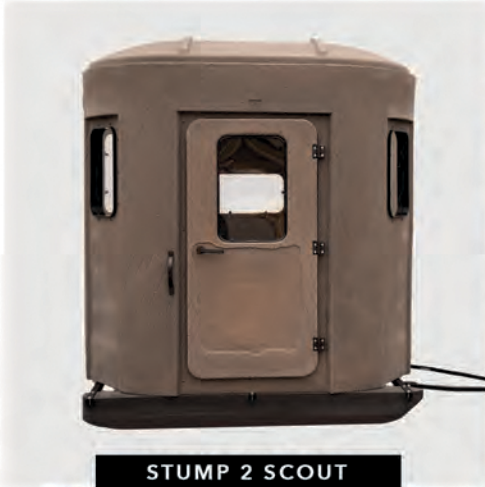
STUMP 2 SCOUT