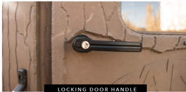
LOCKING DOOR HANDLE