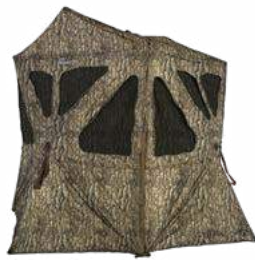
DEADWOOD STUMP AMEBF3002