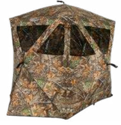
CARE TAKER KICK-OUT AMEBL3016