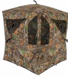
BRICKHOUSE AMEBL3001 | AMEBF3001