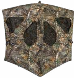
SILENT BRICKHOUSE AMEBL3002 | AMEBF3007