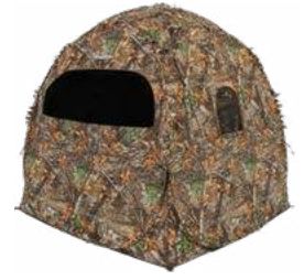
DOGHOUSE AMEBL1002 | AMEBF1000