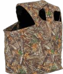
2P TENT CHAIR BLIND AMEBL2001