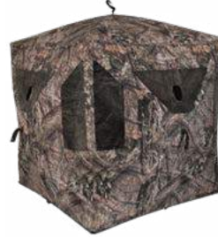
ELEMENT 1MC3H095 | 1MC3H100FR