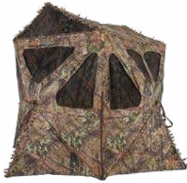
DISTORTER AMEBF3003 | AMEBF3004