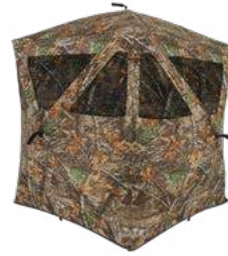
CARE TAKER AMEBL3000 | AMEBF3000