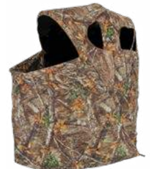
1P TENT CHAIR BLIND AMEBL2000 | AMEBF2000