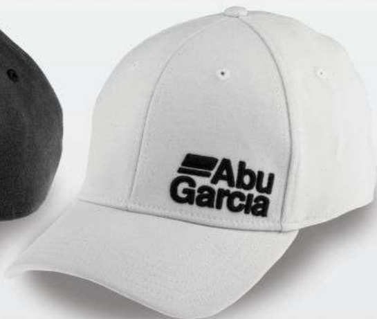
ORIGINAL FITTED HAT