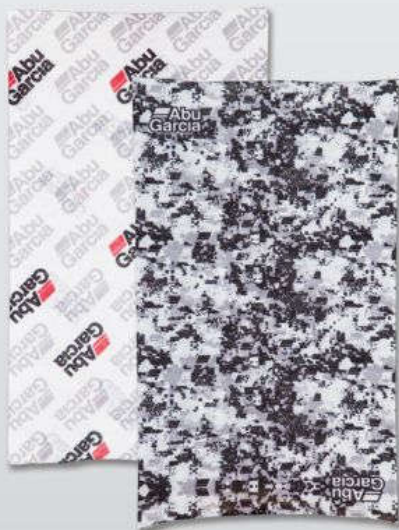
ELITE PERFORMANCE GEAR SOLAR SHADE