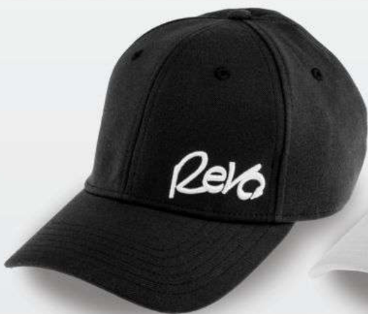
REVO® FITTED HAT