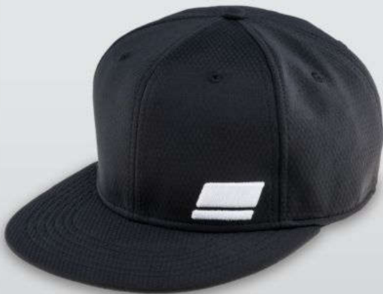
ICON FLAT BILL