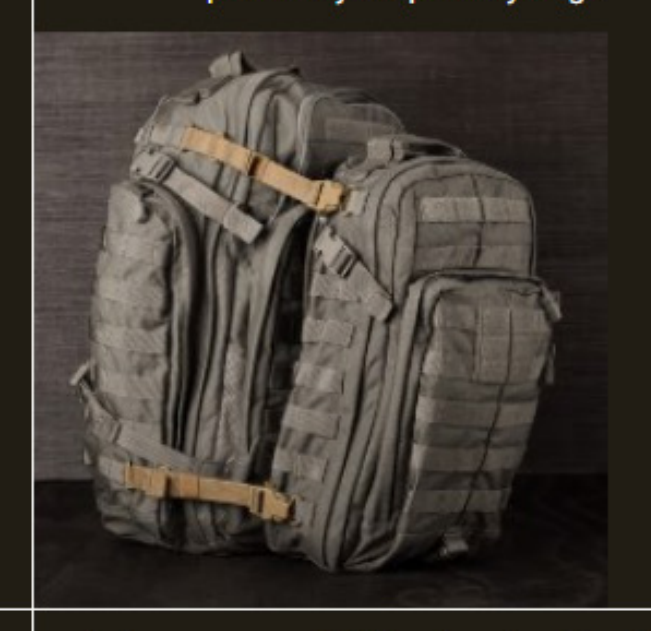
Repeat steps 3-5 for the other 3 webbing strap and buckle sets on your primary and secondary bags.