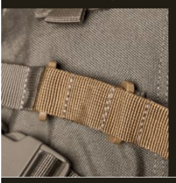
4. Secure the end C-clip of the webbing strap to the same MOLLE strip.