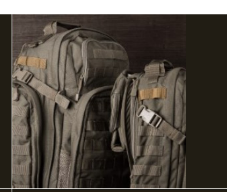
Line up your bags to locate the best anchor points - often the top and bottom side panel MOLLE strips on most backpacks.