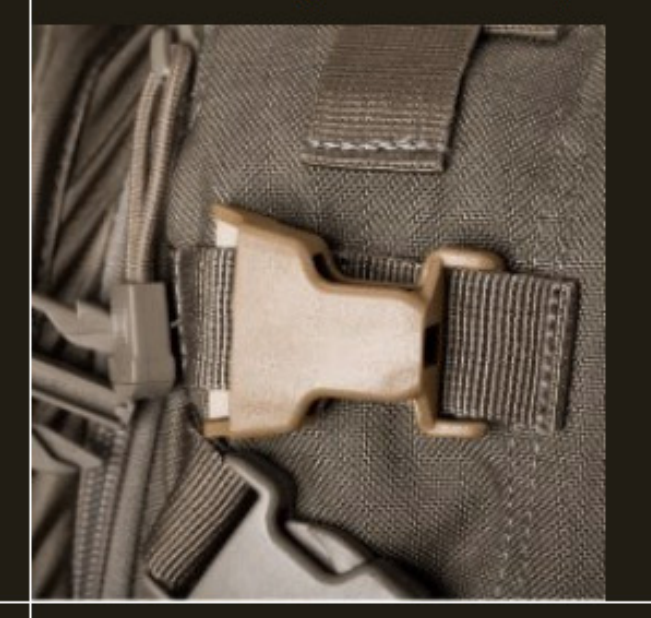
Attach a Tier System buckle to an upper left MOLLE strip on the side panel of your secondary bag.