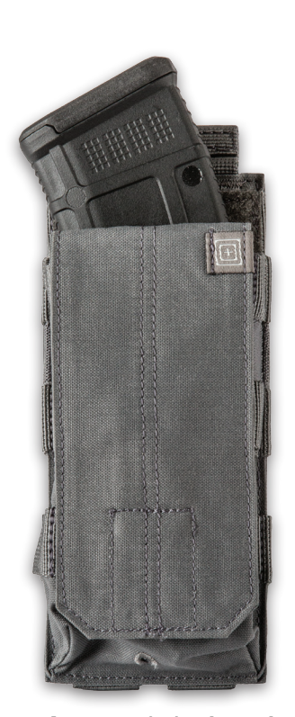
Cover attached to front of the pouch for immediate access to magazines. Can also be tucked into pouch.