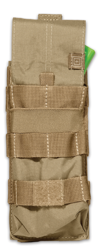
Cover pictured in its place over magazine.