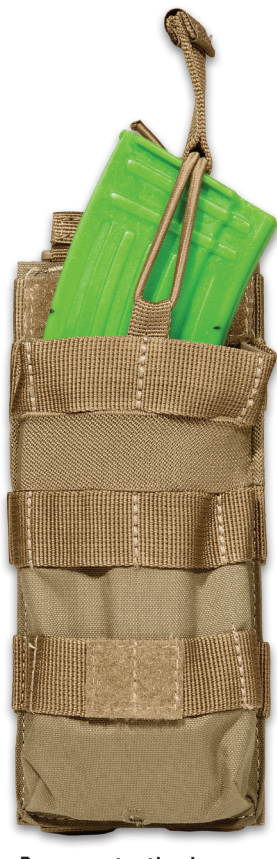
Bungee retention is included for operators who prefer so.